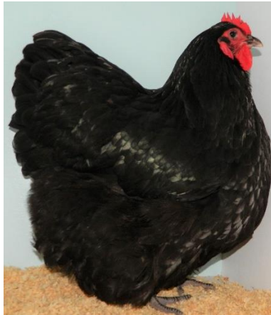
2018 Bird of Show Orpington