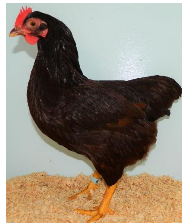
Reserve Rhode Island Pullet