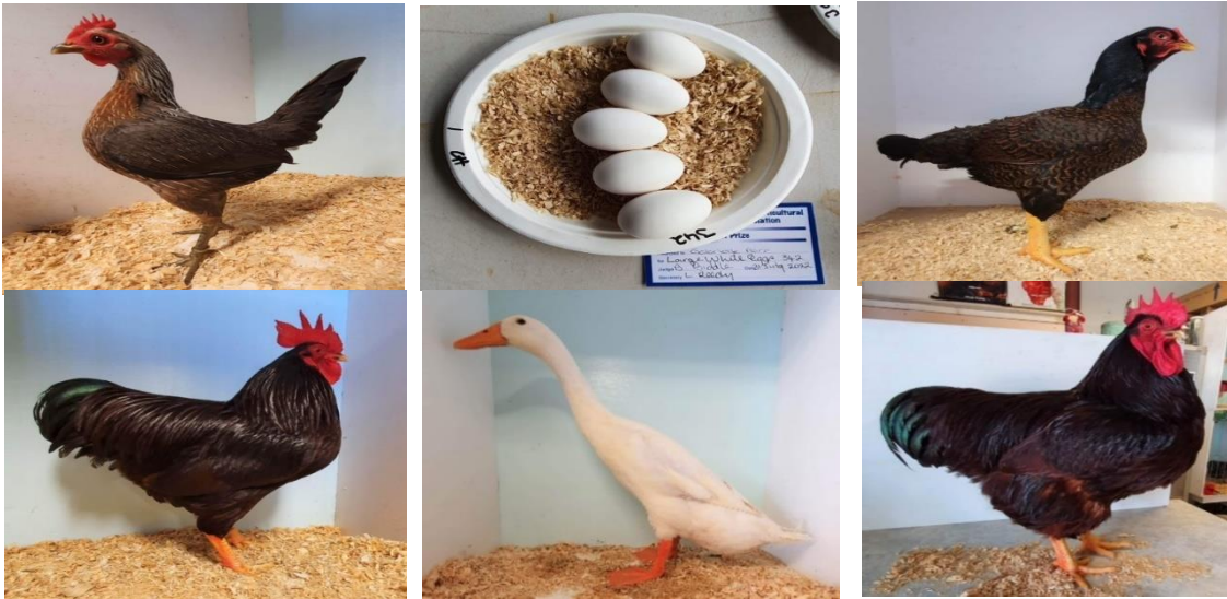
Winners of the 2022 Show